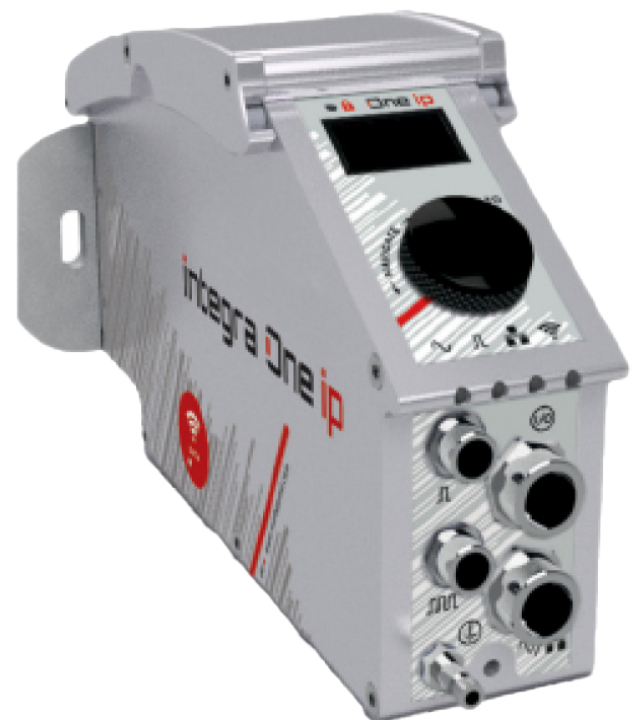
Integra One IP TIJ