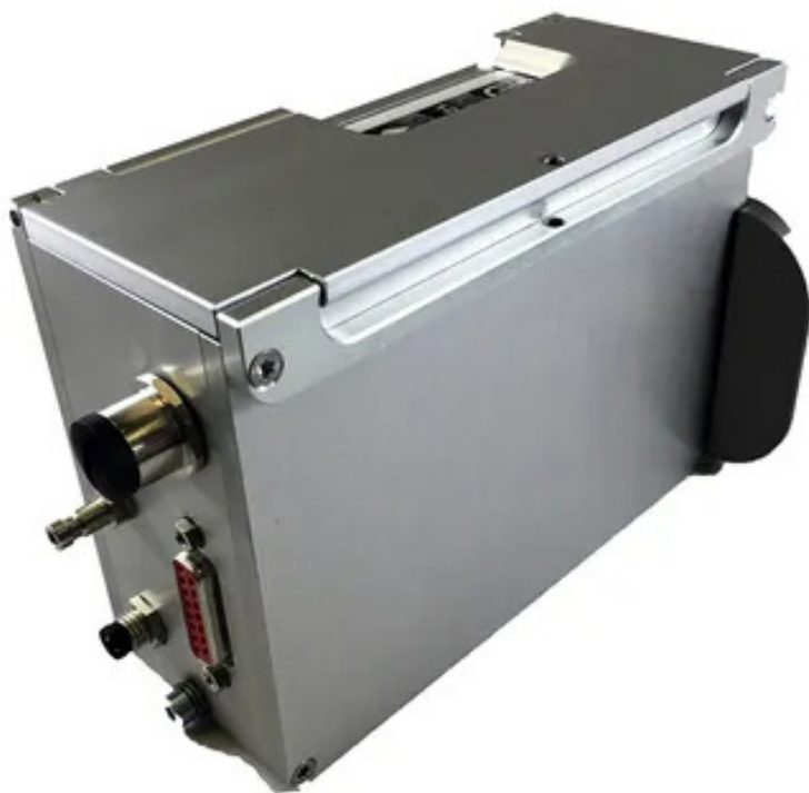
1 Jet Washdown

All environments are different, that's why our sales team will work with you from start to finish to ensure an optimal solution.