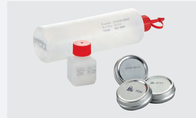
Printing with quick drying ink on metal and plastic (Version MP).